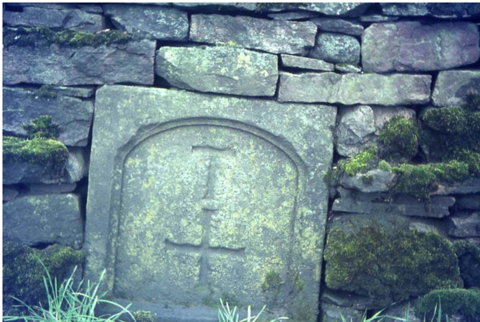
Last month's picture was of a headstone in WORTON Where's this in our area?