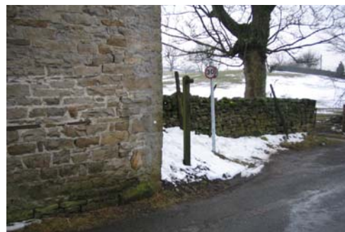
30mph sign can't be seen by approaching drivers!