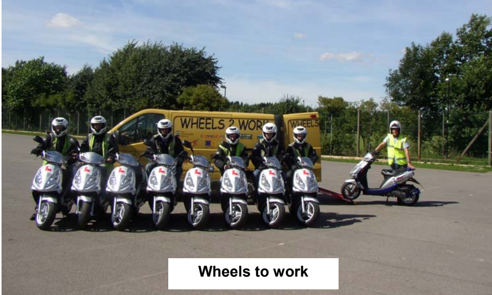
Wheels to work

The pioneering moped loan scheme ‘Wheels 2 Work’ operating in Hambleton, and Richmondshire, aims to help even more people using funding received from the European Regional Development Fund, via the ‘Bolton Manor Group’, for use principally in areas of Wensleydale and Swaledale. Using part of this funding, ‘Wheels 2 Work’ has been able to purchase a further 10 mopeds to increase the total fleet size to 50 mopeds. Priority for the new mopeds will be given to applications from people living in these areas.