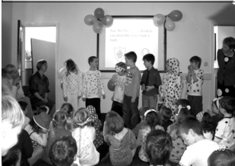
The spotty judging