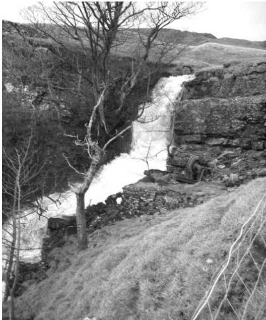
Mystery picture Last month's was looking across to Widdale from Sedbusk Not all our mystery pictures are within the Newsletter circulation area