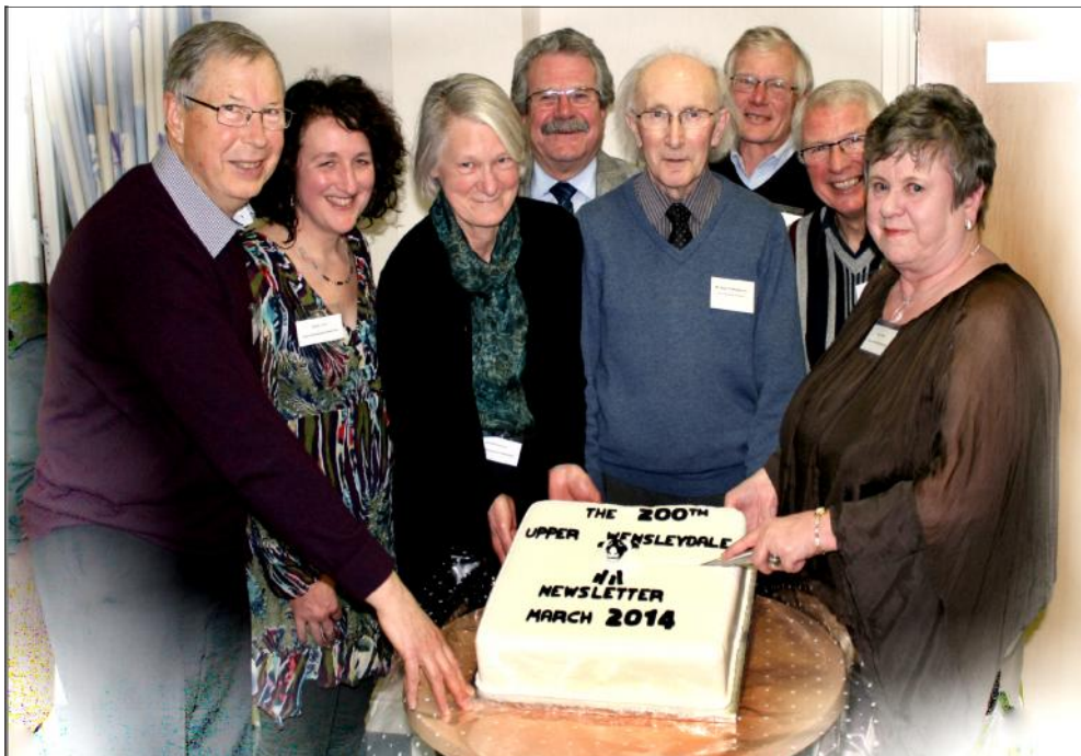
The Newsletter Committee and the cake

In the season of Lent, whether we are particularly religious or not, we maybe decide to 'give something up'. Like those of us who might make New Year resolutions, we're not sure how long the effort lasts! But how about this for a change: instead of (or in addition to) giving something up, why not take something up , like a bit of steady volunteering? There really are some 'enlightened self interest' benefits as well!