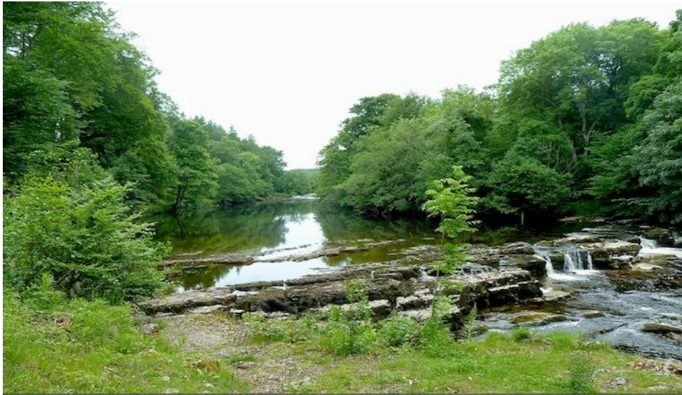
Mystery picture. Last month's was of the Lion's Head rock formation near the Dalesway and Conistone.