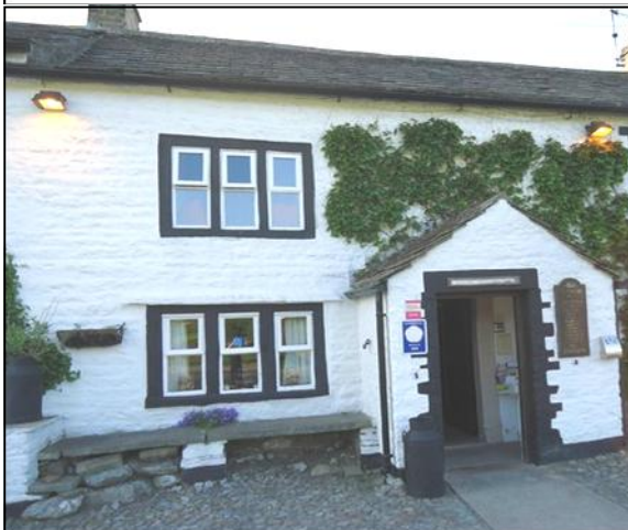
Mystery picture. Where's this? Last month's was of Back Lane, West Witton.