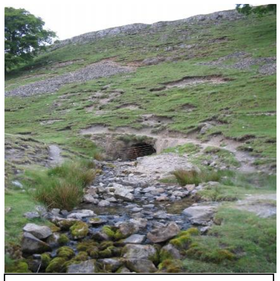
Mystery picture Last month's was of 'The Old School House', West Witton. Where's this?

Tickets £10 (£5 U16) Tel 624510 www.theoldschoolhouseleyburn.co.uk