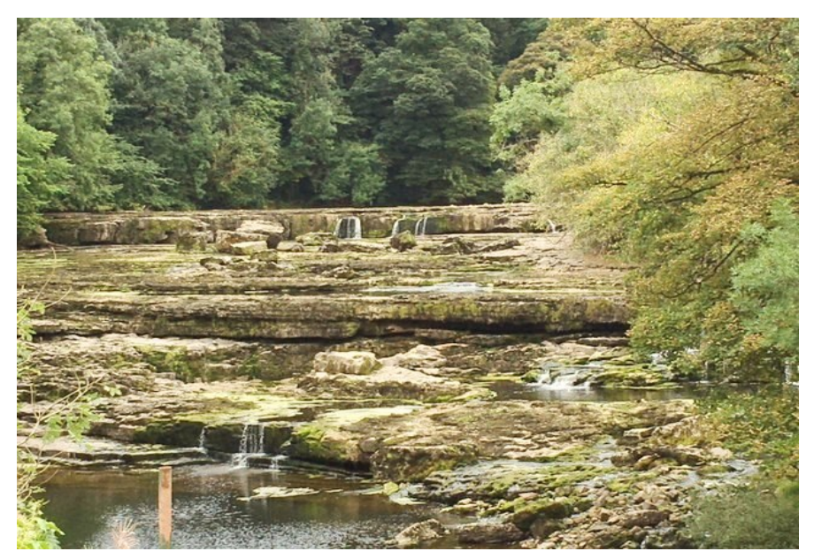
This could be another Mystery Picture!! Here is Aysgarth (lack of) Falls after a very dry September.